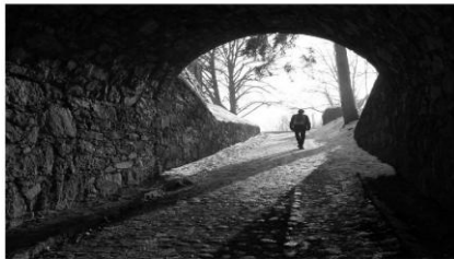
Fig 4. Original image