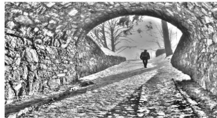
Fig 5. Image processed by traditional Retinex Algorithm

Fig 4 is original image and Fig 5 is the resultant processed by traditional Retinex Algorithm Fig 6 is the output image which has been processed by modified Retinex Algorithm, the image processed by modified Retinex Algorithm is very clearer in visible and uniform illumination.