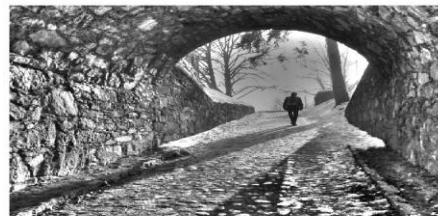
Fig 6. Image processed by modified Retinex Algorithm

Fig 4 is original image and Fig 5 is the resultant processed by traditional Retinex Algorithm Fig 6 is the output image which has been processed by modified Retinex Algorithm, the image processed by modified Retinex Algorithm is very clearer in visible and uniform illumination.